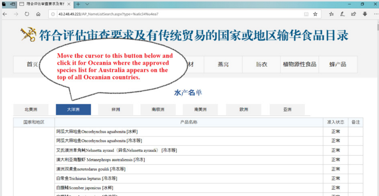
Picture 1: Zoom-in picture to look at the China approved list for Australia

http://43.248.49.223/AP_NameListSearch.aspx?type=%u6c34%u4ea7